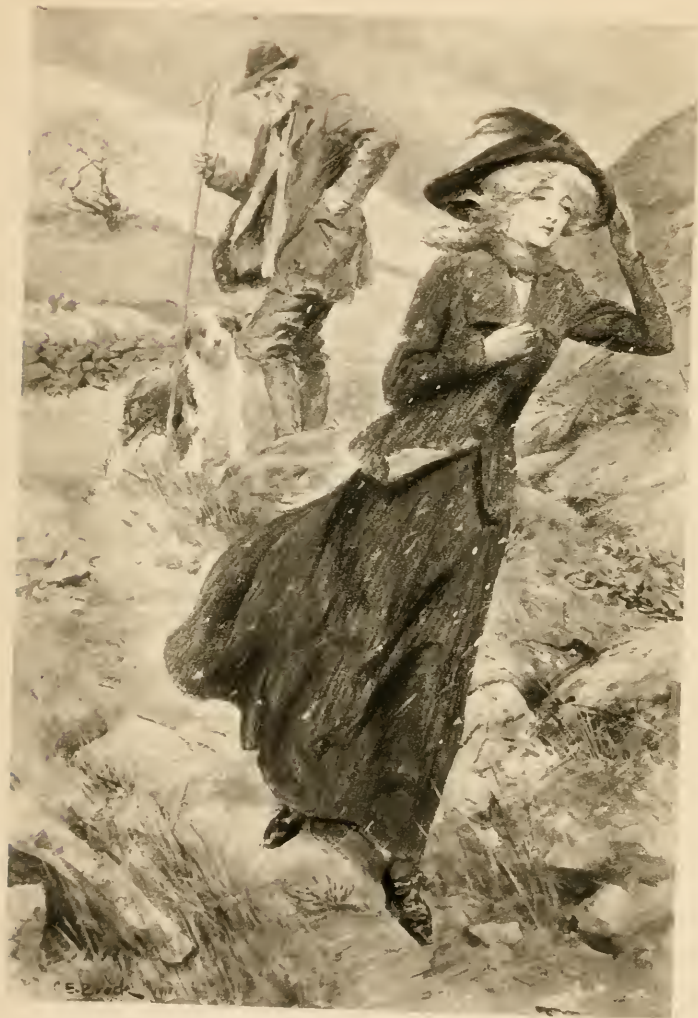
"The old shepherd looked after her doubtfully"